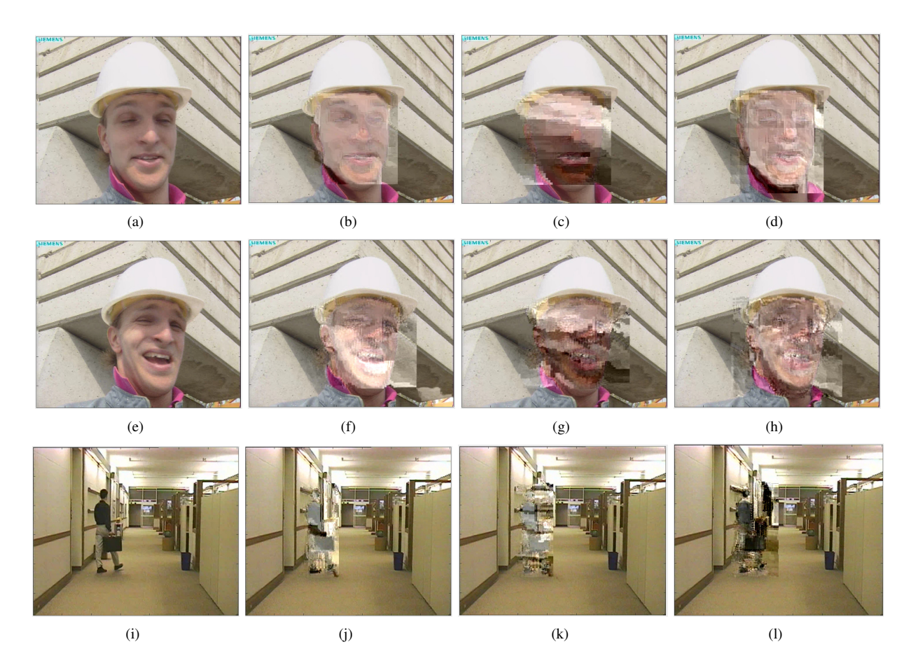
Fig. 2: With CIF size, QP= 24 and IP = 5: (a) The 1st frame of original 'foreman' (I frame), (b) encrypted by SNC, (c) encrypted by SNC+IPM, (d) encrypted by our process. (e) The 15th frame of original 'foreman' (P frame), (f) encrypted by SNC, (g) encrypted by SNC+IPM, (h) encrypted by our process. (i) The 40th frame of original 'hall' (P frame), (j) encrypted by SNC, (k) encrypted by SNC+IPM, (l) encrypted by our process.

We are evaluating the security of our process in terms of brute force and replacement attacks and we are refining the method to be robust against these attacks.