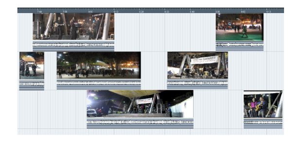
Fig. 1. Time-aligned audio clips<sup>2</sup>. Information about the quality of the clips is very useful to choose which clip should be played.